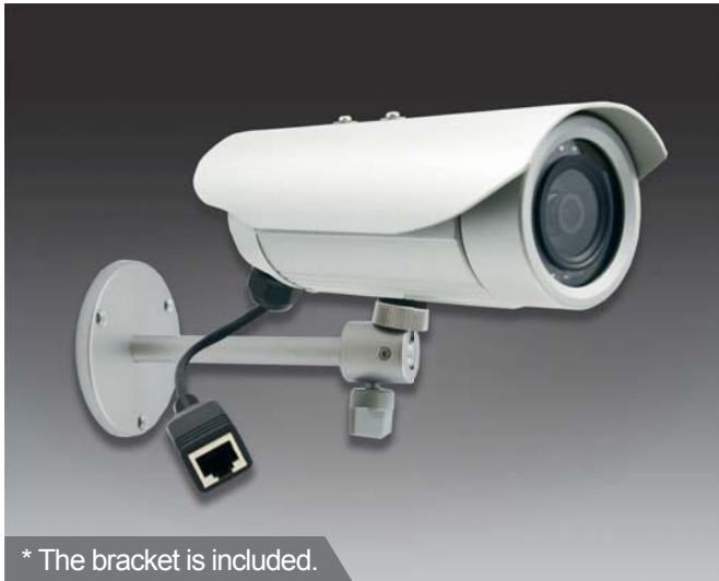
* The bracket is included.