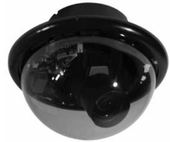
HD5 Series (Black shown)